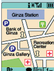
NTT DoCoMo offers location-based business searches, eatery guides, and maps.

that carriers began selling last year, so that services can be tailored to a user’s up-to-the-minute location. KDDI has sold about five million of the phones in their first year of availability.