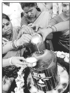
Devotees offer milk to the lingam.