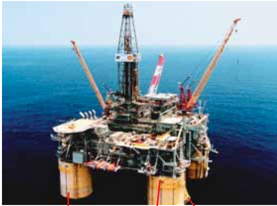
Abnormal interior pressure High temperature Leaking

Relevant parameters need to be captured/measured: