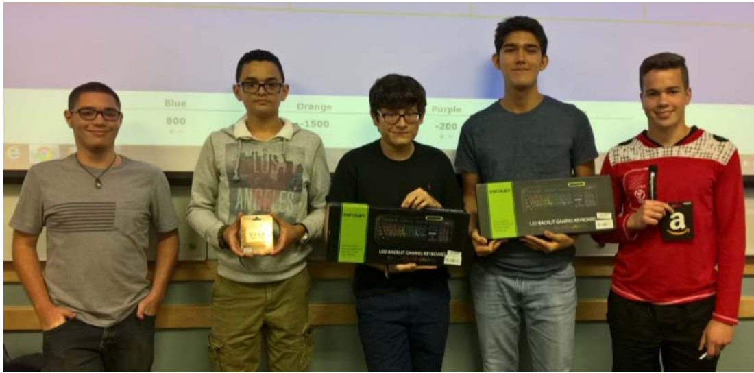
Second place team: AP CS High school students