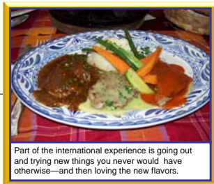
Part of the international experience is going out and trying new things you never would have otherwise—and then loving the new flavors.