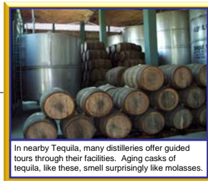
In nearby Tequila, many distilleries offer guided tours through their facilities. Aging casks of tequila, like these, smell surprisingly like molasses.