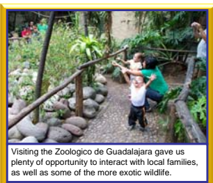
Visiting the Zoologico de Guadalajara gave us plenty of opportunity to interact with local families, as well as some of the more exotic wildlife.