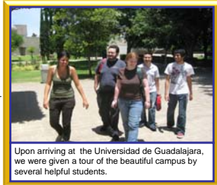
Upon arriving at the Universidad de Guadalajara, we were given a tour of the beautiful campus by several helpful students.