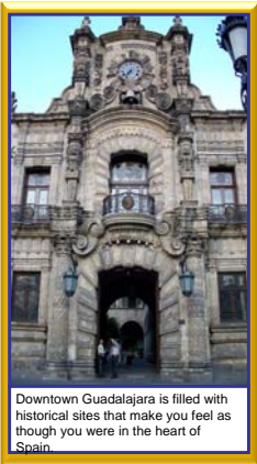
Downtown Guadalajara is filled with historical sites that make you feel as though you were in the heart of Spain.