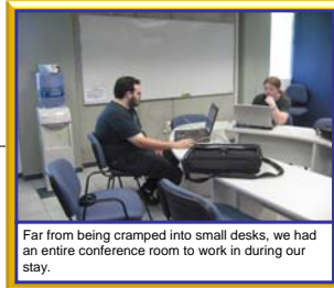
Far from being cramped into small desks, we had an entire conference room to work in during our stay.